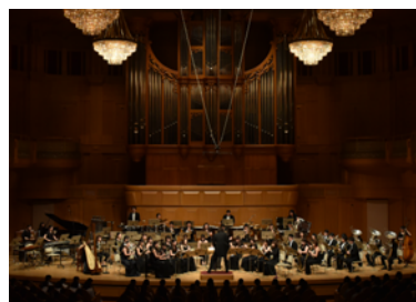
The 20th Subscription Concert