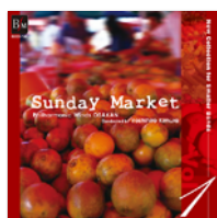
New Collection for Smaller Bands