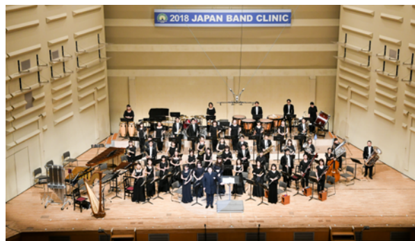
Japan Band Clinic