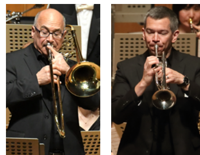
The 24th Subscription Concert with Joseph Alessi