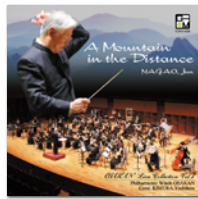
OSAKAN Live Collection Vol.7