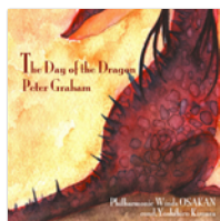
OSAKAN Live Collection