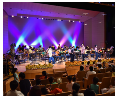
Family Concert Series